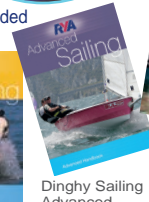
Dinghy Sailing Advanced Handbook