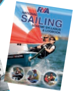
National Sailing Scheme Syllabus & logbook